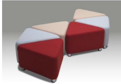
Triangular Seating Range

Our soft seating range is both simple and flexible. The range of occasional low level modular seating available in triangular, wave or rhombus shapes can be combined to create a multitude of shapes and designs. Ideal for breaking up large open plan spaces and creating informal meeting areas. Available in a wide choice of colours.