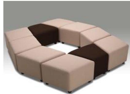
Rhombus Seating Range